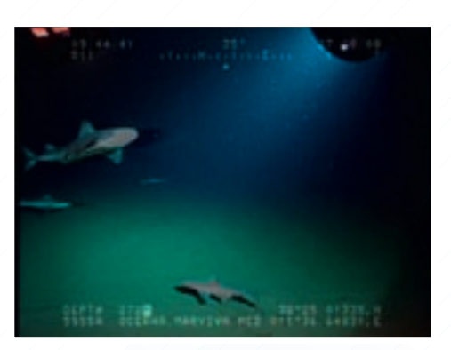
Figure 2: Squalus blainville reacting to ROV, Aceste seamount, Italy, 2008.