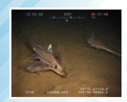
Figure 1: Two Chimaera monstrosa over a muddy bottom in the Capbreton Canyon, Bay of Biscay, 2008.