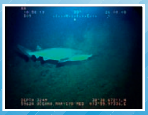
Figure 5: Hexanchus griseus on the Enareta seamount, Italy, at 324 m depth, 2008.