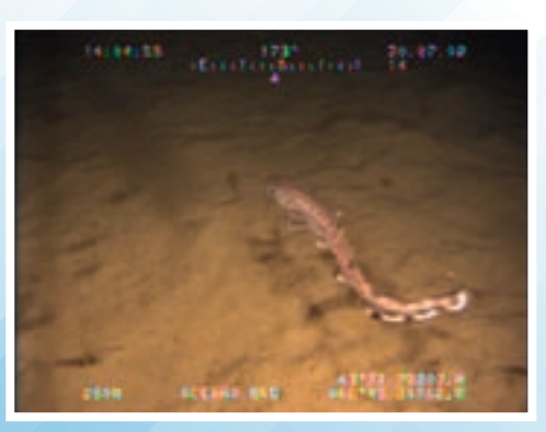
Figure 4: Galeus atlanticus in the Capbreton Canyon, Bay of Biscay, 2008.